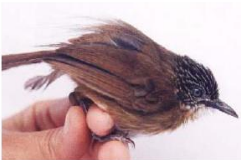
Fig. 6. Macronous striaticeps (Philippine-endemic) Brown-tit Babbler

Some Philippine-endemic and Mindanao-endemic Birds on Canticol and Mt. Hilong-hilong, Philippines