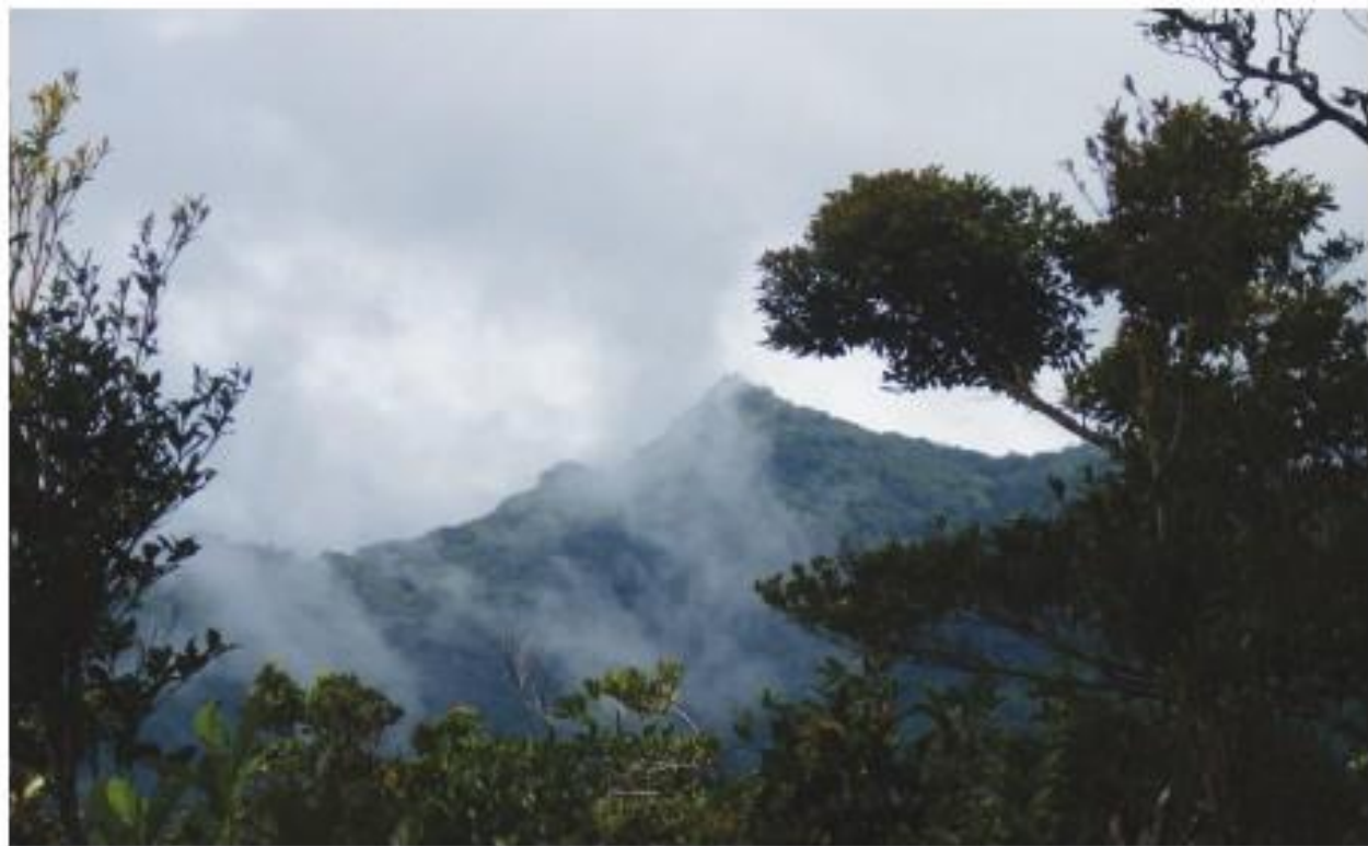
Fig. 4. Panoramic View of Mt. Hilong-hilong, RTR, Agusan del Norte.