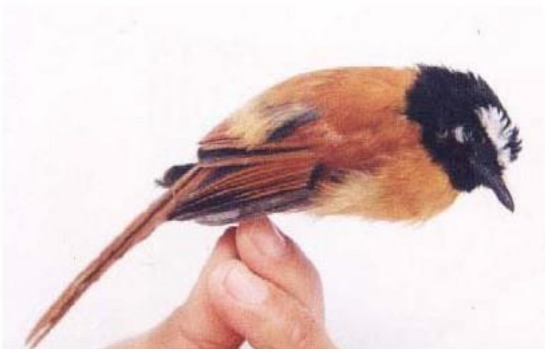
Fig. 8. Rhipidura nigrocinnamomea (Philippine-endemic) Black and Cinnamon Fantail