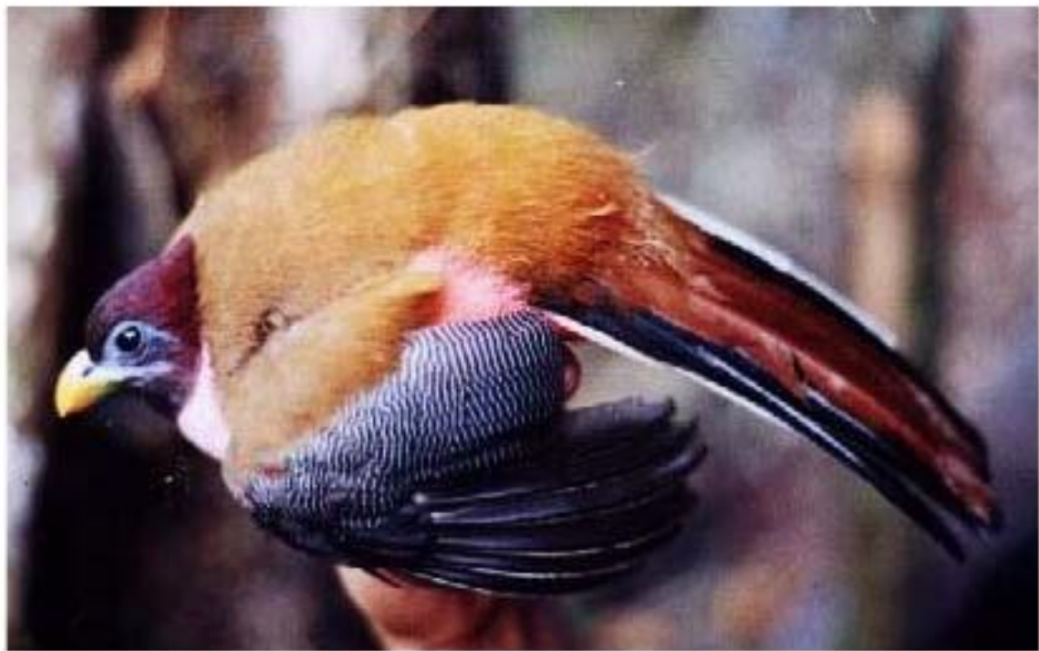
Fig. 11. Harpactes ardens (Philippine-endemic) Philippine trogon