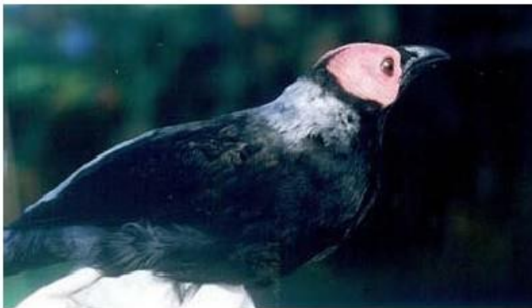
Fig. 13. Sarcops calvus (Philippine-endemic) Coletto