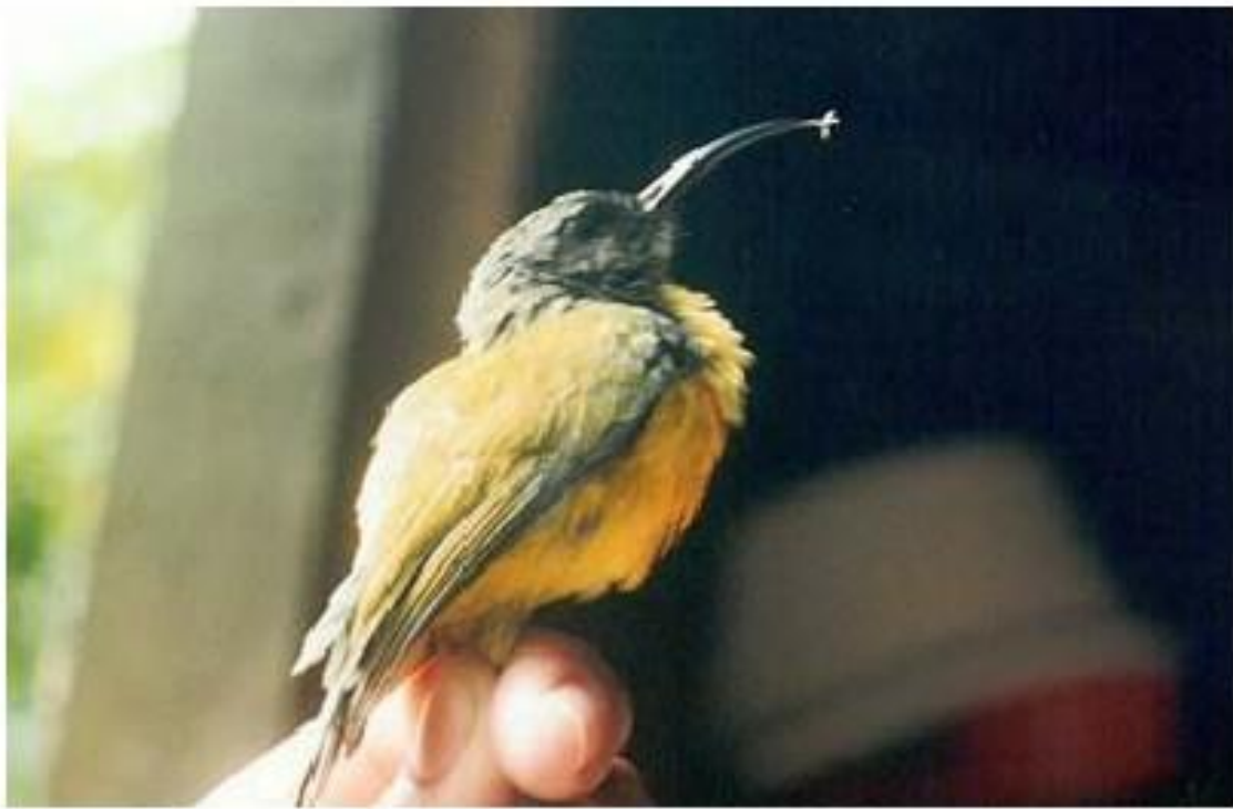
Fig.7. Aethopyga boltoni (Near-threatened Mindanao-endemic) Apo Sunbird