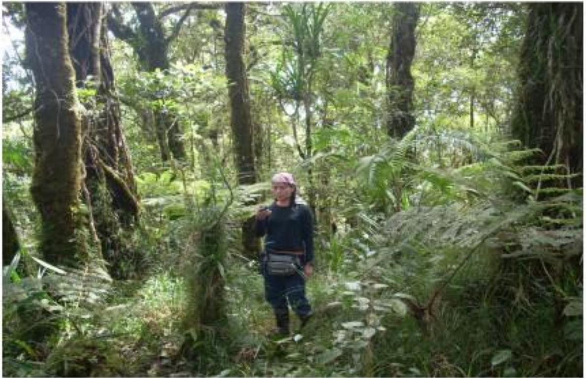
Fig. 5. Habitat Assessment in one of the sampling points on Canticol.

Some Philippine-endemic and Mindanao-endemic Birds on Canticol and Mt. Hilong-hilong, Philippines