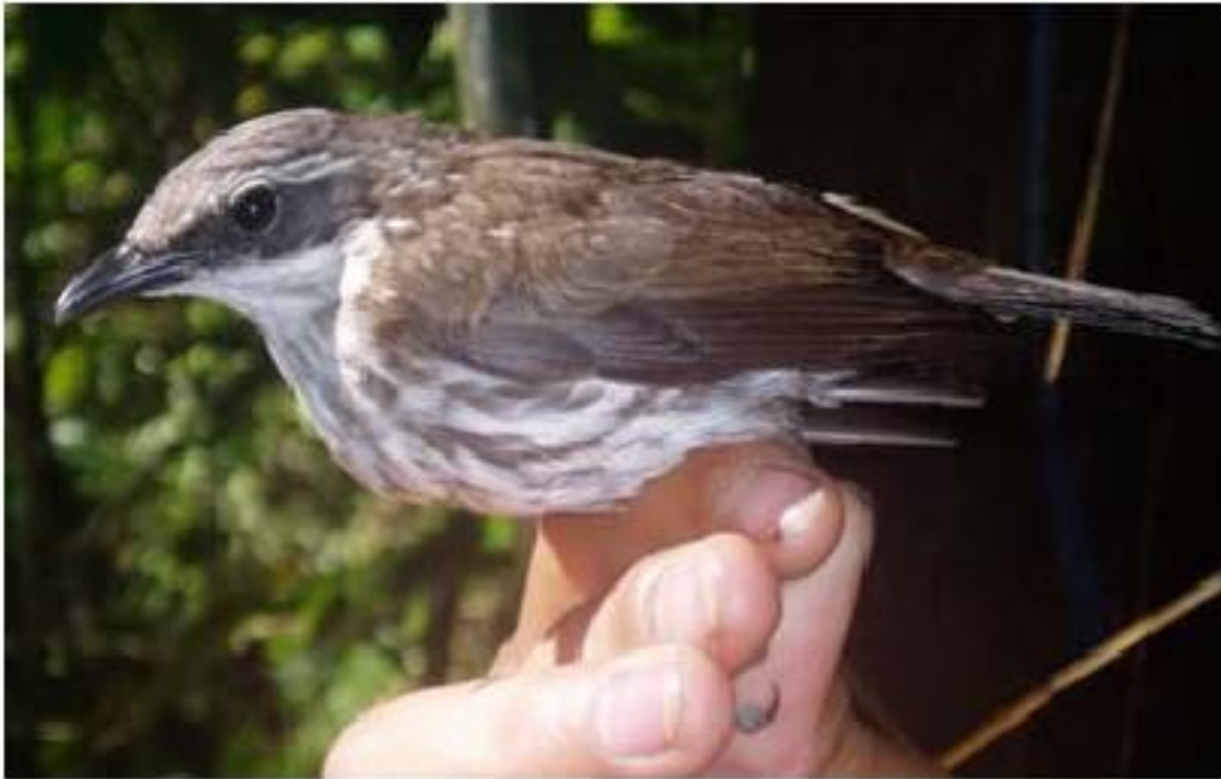
Fig. 9. Rhabdornis inornatus (Philippine-endemic) Stripe-breasted Rhabdornis