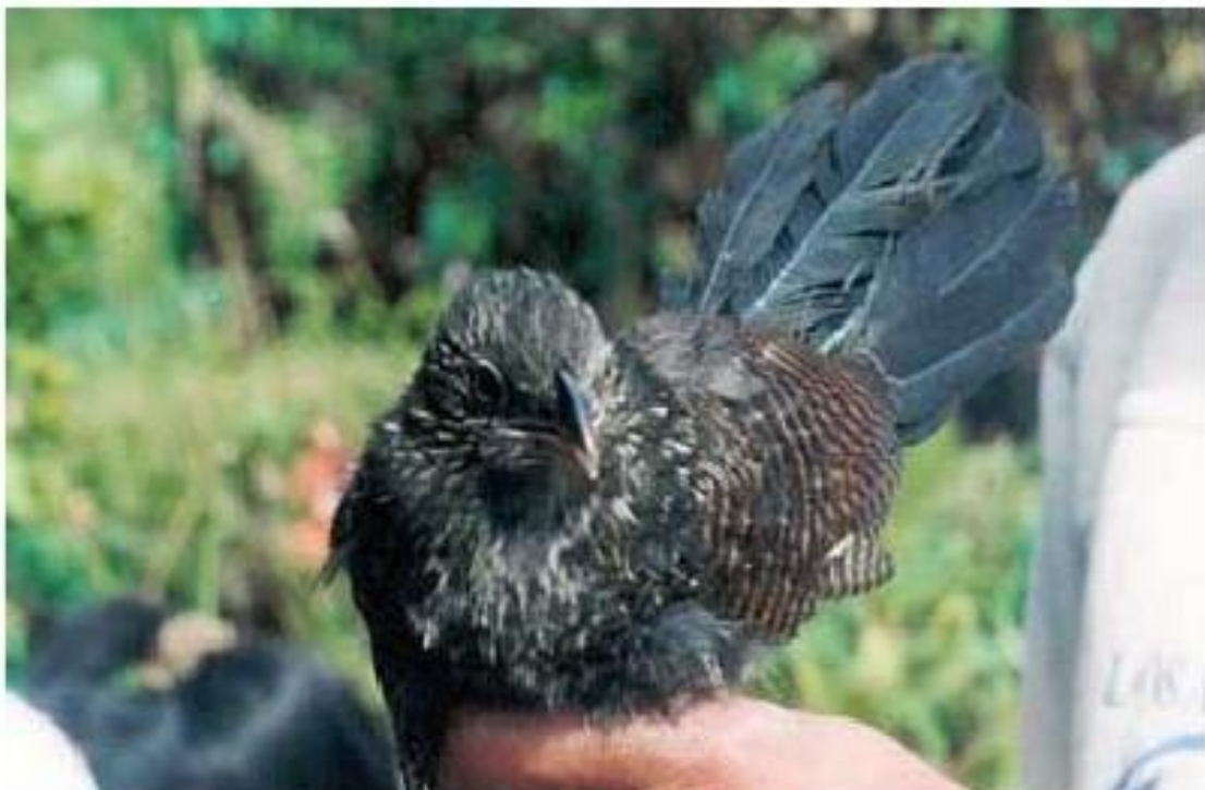
Fig. 10. Centropus viridis (Philippine-endemic) Philippine Coucal