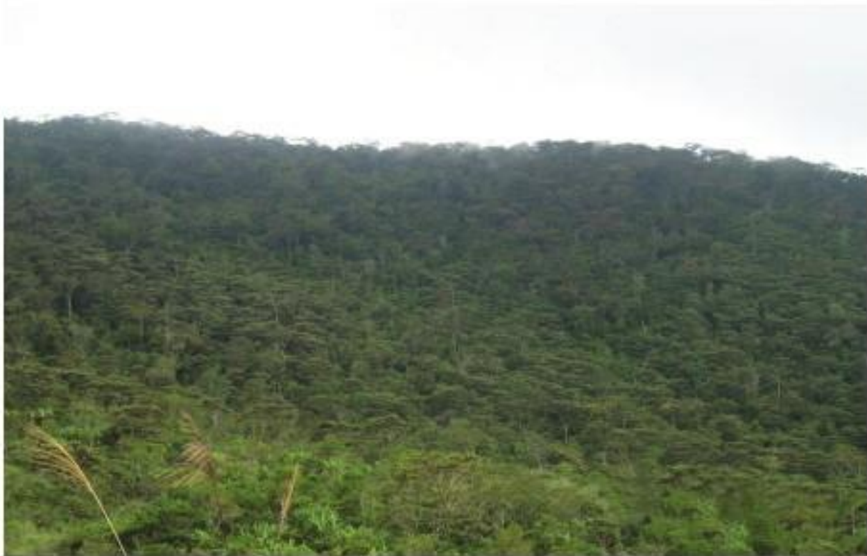
Fig. 3. Panoramic View of Canticol, Tubay, Agusan del Norte.