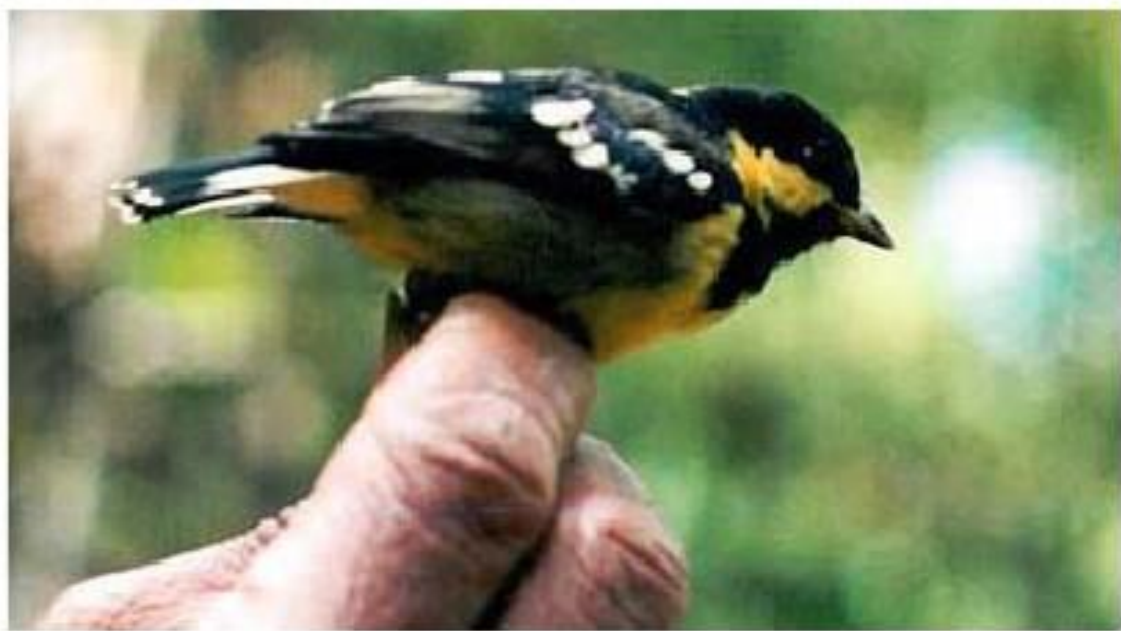
Fig. 12. Parus elegans (Philippine-endemic) Elegant Tit