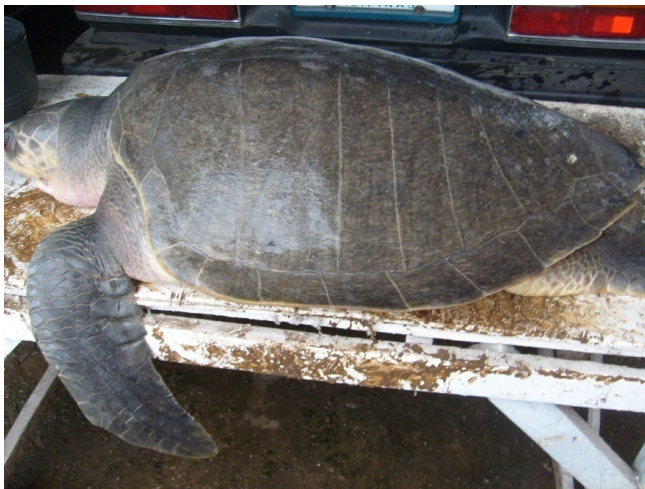
Fig. 6. Carcass of an Olive Ridley Turtle ( Lepidochelys olivacea ) retrieved in Magsaysay, Gingoog Bay (photo courtesy of LandoPagara).

The pantropical olive ridley turtle (Fig. 6) is the smallest, but most abundant sea turtle species (Pritchard, 1997). They occur mostly in the northern hemisphere and in the Philippines are known to nest in areas facing the South China Sea (Cruz, 2002). They are pelagic species, foraging kilometers away from mainland shores, hence, rarely seen in shallow coastal areas except when nesting (Swimmer, et al., 2006; Polovina et al., 2004; and Barbour et al., 1994).