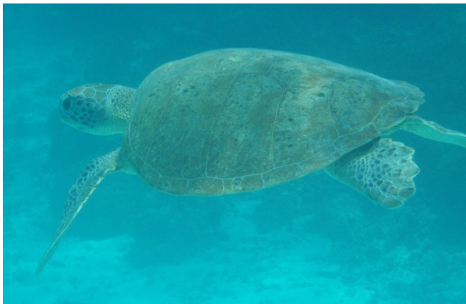
Fig. 5. Green Turtle ( Chelonia mydas ) in Duka Medina, Gingoog Bay.

The green turtle (Fig. 5) is widely distributed in tropical and subtropical. It is the most abundant sea turtle in the Western Pacific region with distributions from the Gulf of Thailand all the way to the French Polynesia. Adult green turtles are herbivorous, and one of the few marine animals to feed exclusively on seagrasses, thus playing an important role in the cycling of nutrients in seagrass meadows (Bjorndal, 1980). In this region, its major nesting ground is in the Turtle Islands of the Sulu-Sulawesi region of Southeast Asia (Cruz, 2002) but have been known to travel up to 800kms from their nesting site to foraging grounds (Sagun, 2004; Luschi et al., 1998; and De Veyra, 1994).