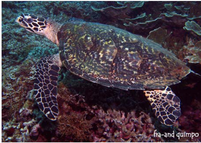
Fig. 4. Hawksbill Turtle ( Eretmochelys imbricata ) in Agutayan Island, Jasaan, Macajalar Bay.