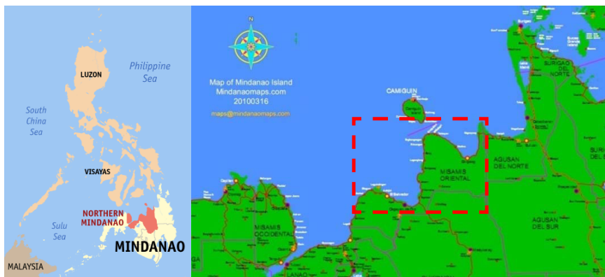
Fig. 1. Map of Northern Mindanao, Macajalar and Gingoog Bays in broken box

Macajalar and Gingoog Bays are 2 adjacent bays situationally located in Northern Mindanao (Fig. 1). Nineteen geopolitical units make up Macajalar and Gingoog Bays, encompassing a combined coastline of approximately 180kms. The shorelines of both bays are mixed sandy beaches and rocky beaches with some outcroppings occurring intermittently. Numerous rivers and streams sporadically cut through the coastline. Industrialized zones, breakwaters, and barriers also cut across the beaches in both bays. Presence of sea turtles was documented at the barangay level of the municipalities/cities.