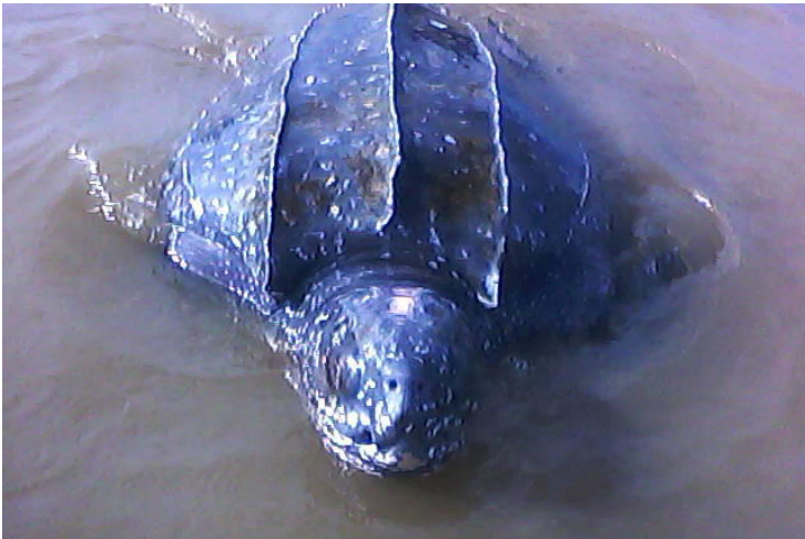
Fig. 7. Beached Leatherback Turtle ( Dermochelys coriacea ) in Villanueva, Macajalar Bay.

The largest sea turtle (Fig. 7), the leatherback turtle, is unique among the marine turtles in lacking a bony carapace, instead having a leathery skin with 7 distinct ridges that run from the anterior to the posterior part of the carapace as opposed to the traditional bony shell of the other marine turtles (Barbour et al., 1994).